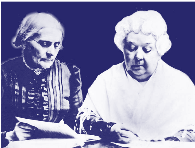
Suffrage organizer Susan B. Anthony (left) and Elizabeth Cady Stanton, founder of the women's movement.