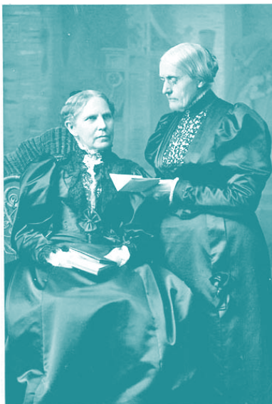
Susan B. Anthony with her sister, Mary.

The "Marriage & Maternity" article, furthermore, bears striking resemblance to Anthony's "Social Purity" speech in language, concepts, and themes. Laws, according to both, were wrongly used to punish people whose actions were impelled by desperate circumstances—people who could not support themselves financially, vote, or even, in