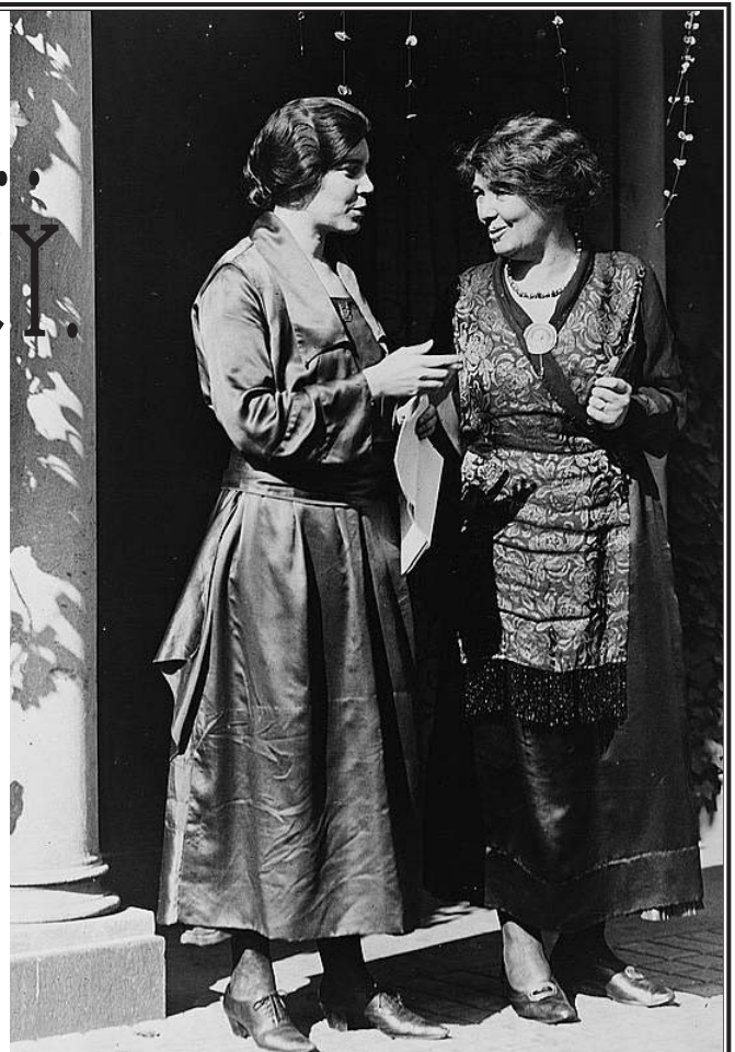
Alice Paul, author of the original Equal Rights Amendment, with British suffragist Emmeline Pethick-Lawrence.