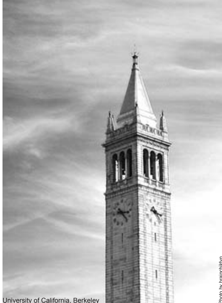
University of California, Berkeley

Share your creative solutions and keep the revolution alive! We want to know about your efforts—so be sure to keep us updated on what you are doing on your campus to support pregnant and parenting students. Send your ideas to coordinator@ffloncampus.org so we can share your progress with other pro-life student leaders! •