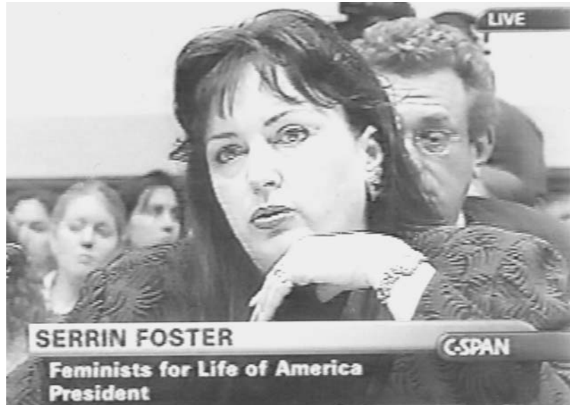
Feminists for Life was the only pro-life group in the National Task Force on Sexual Assault and Domestic Violence to work successfully for the Violence Against Women Act, which was passed in 1994.